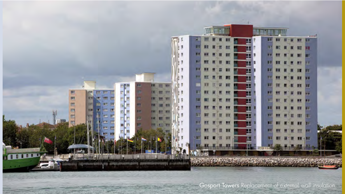
Gosport Towers Replacement of external wall insulation