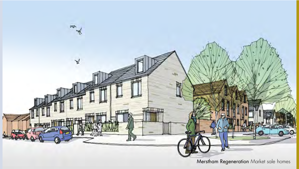
Merstham Regeneration Market sale homes