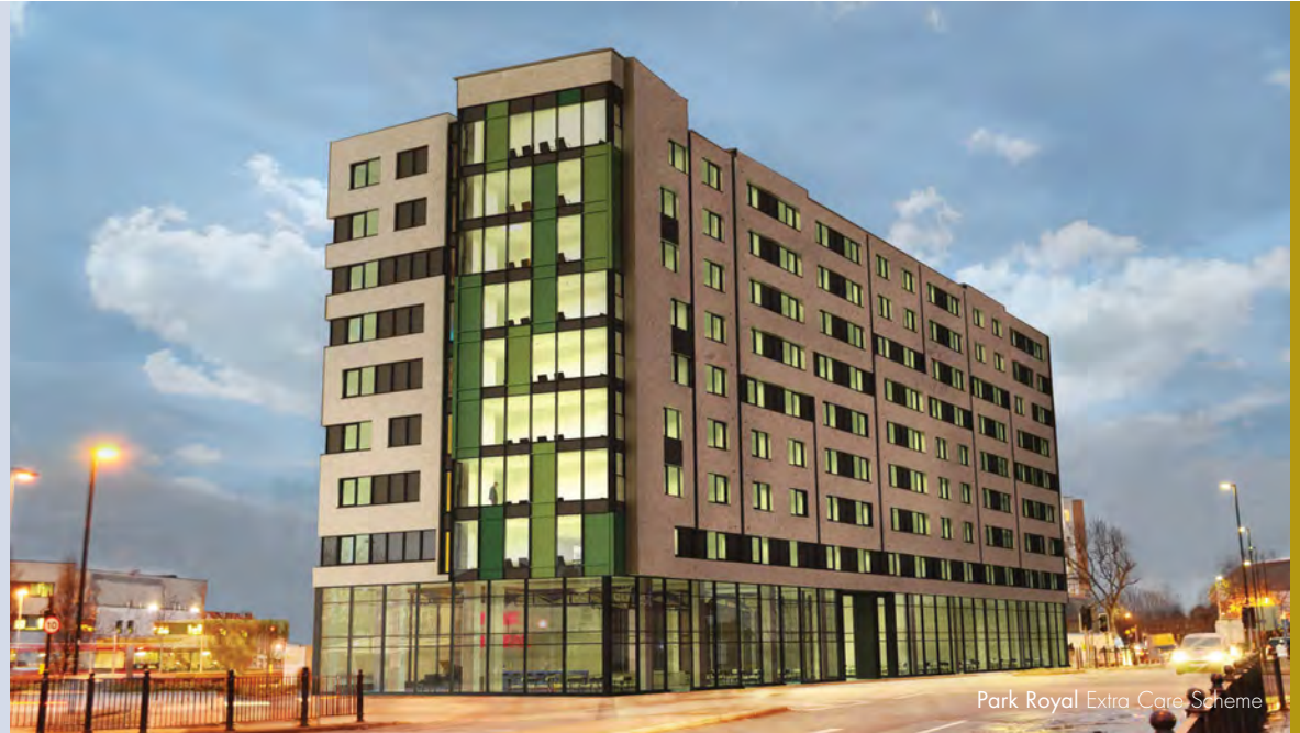
Park Royal Extra Care Scheme