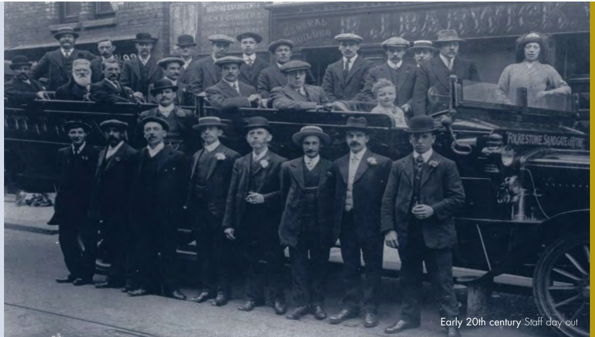
Early 20th century Staff day out